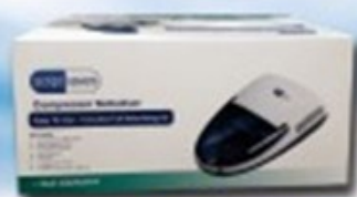
ScriptSavers Compressor Nebuliser

participating products, write your details on the back of your till slip & place it in the entry box