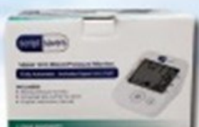
ScriptSavers Upper Arm Blood Pressure Monitor